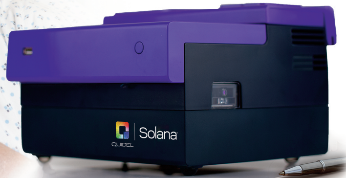
Solana Influenza A+B Assay run with the Solana bench top instrument a mere 9.4" x 9.4" x 5.9"

The Accurate. Sustainable. Molecular Flu Solution.